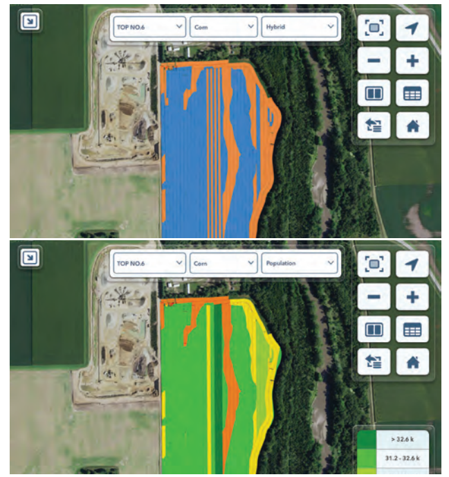
See how mSet was utilized to plant the best hybrid for these different areas of the field.

In this field, there are timber soils along the treeline, as well as some gravel veins that run through the middle of the field. For years this field has seen reduced profit potential from being planted to a single hybrid.